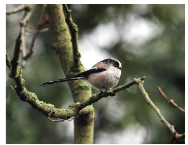
Long-tailed tit

We ended the walk, bordering the golf course and woodland adjacent to Birchwood Road, investigating the Joydens Wood Residents Horticultural shed, before returning to the Summerhouse Drive entrance – where we started some three hours earlier.