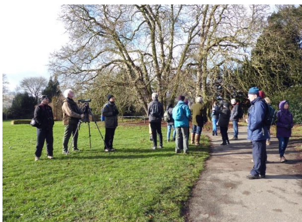
Some of 19 members on the lookout

Continuing the walk between Chis & Sid School and the lake, magpies, crows, woodpigeons, parakeets and robins, blue and great tits were noted and on the “choppy” water of the lake, plenty of mallard, moorhen, coot and Canada geese were attracted to some bread being thrown. A single Egyptian goose also muscled its way in. At the golf course end 20+ black-headed gulls of varying plumages and two little grebes were very active.