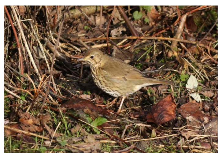
Song Thrush – Ralph Todd

Having looked across the Foots Cray Playing fields towards B&Q/Coca-Cola giving everyone their bearings we retraced our steps as a second flock of fieldfares flew over south – all five thrush species seen. The ponies were keen to say hello, probably in hope of some additional food. We noticed one, close to the fence