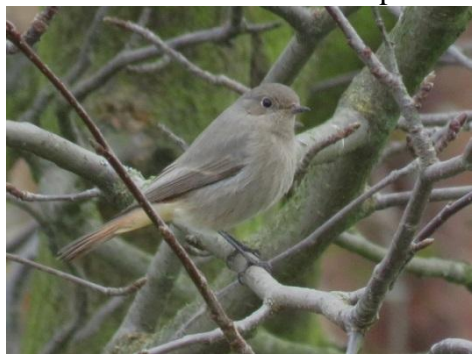
Black Redstart Crossness Donna Zimmer

103 Common Redstart Phoenicurus phoenicurus — uncommon passage migrant Crayford Marshes Landfill—male Apr 12<sup>th</sup>. Crossness —Male Apr 10<sup>th</sup> and 13<sup>th</sup> another around the stables area on Sep 7<sup>th</sup>.