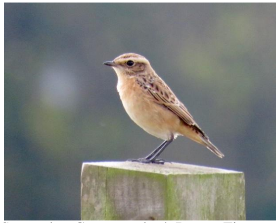
Female Stonechat October Crossness