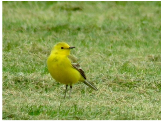
Yellow Wagtails – Danson Park – Donna Zimmer

95 Grey Wagtail Motacilla cinerea – locally common breeding resident, passage migrant Regularly recorded along stretches of the Rivers Cray and Shuttle Recorded each month of the year along the Thames Foreshore ( Erith – Crossness ),