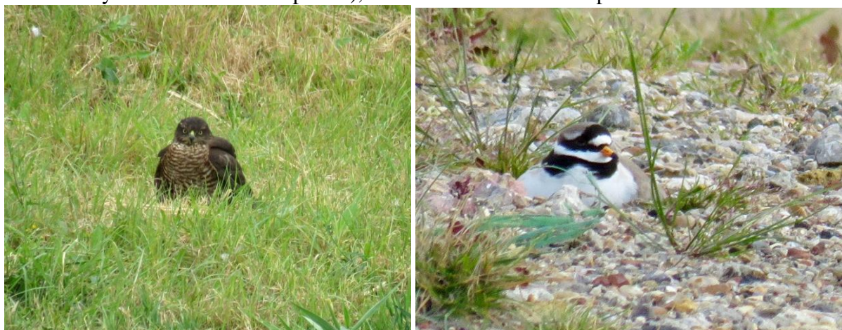
Juvenile Sparrowhawk and Ringed Plover – both Crossness