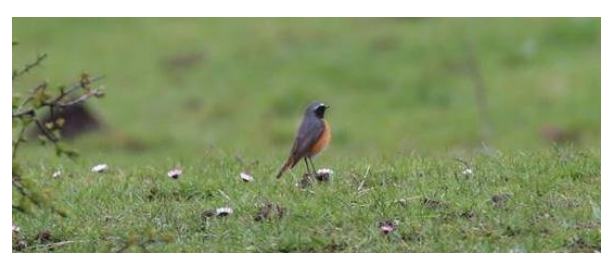
Common Redstart Crossness