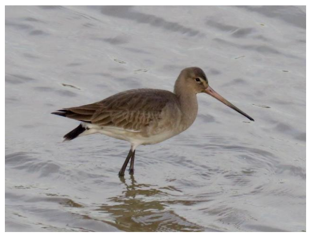
Common snipe and Black-tailed Godwit (winter) – both Crossness – Donna Zimmer

50 Black-tailed Godwit Limosa limosa – passage migrant and winter visitor.