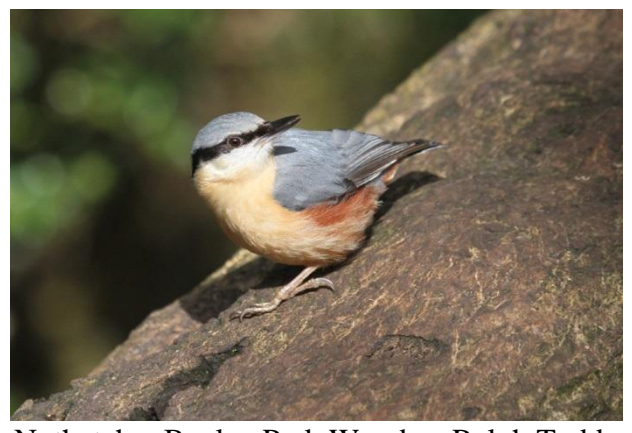
Nuthatch - Bexley Park Woods - Ralph Todd