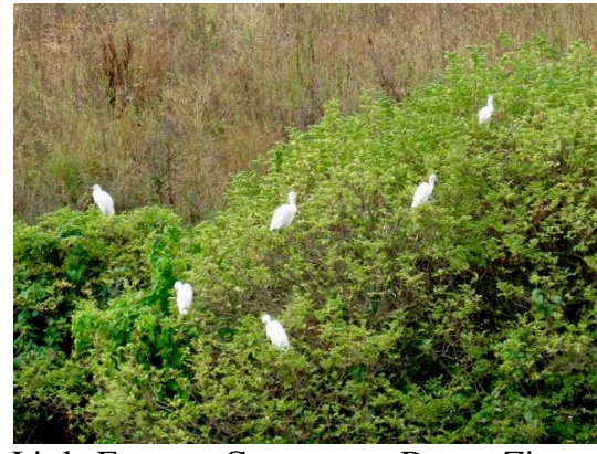
Little Egrets – Crossness – Donna Zimmer