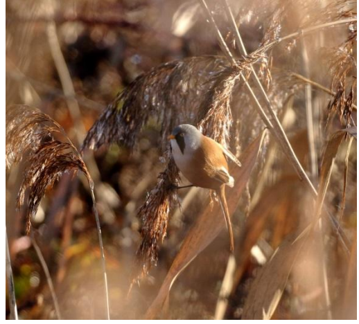
Bearded Tits – Crossness – Donna Zimmer