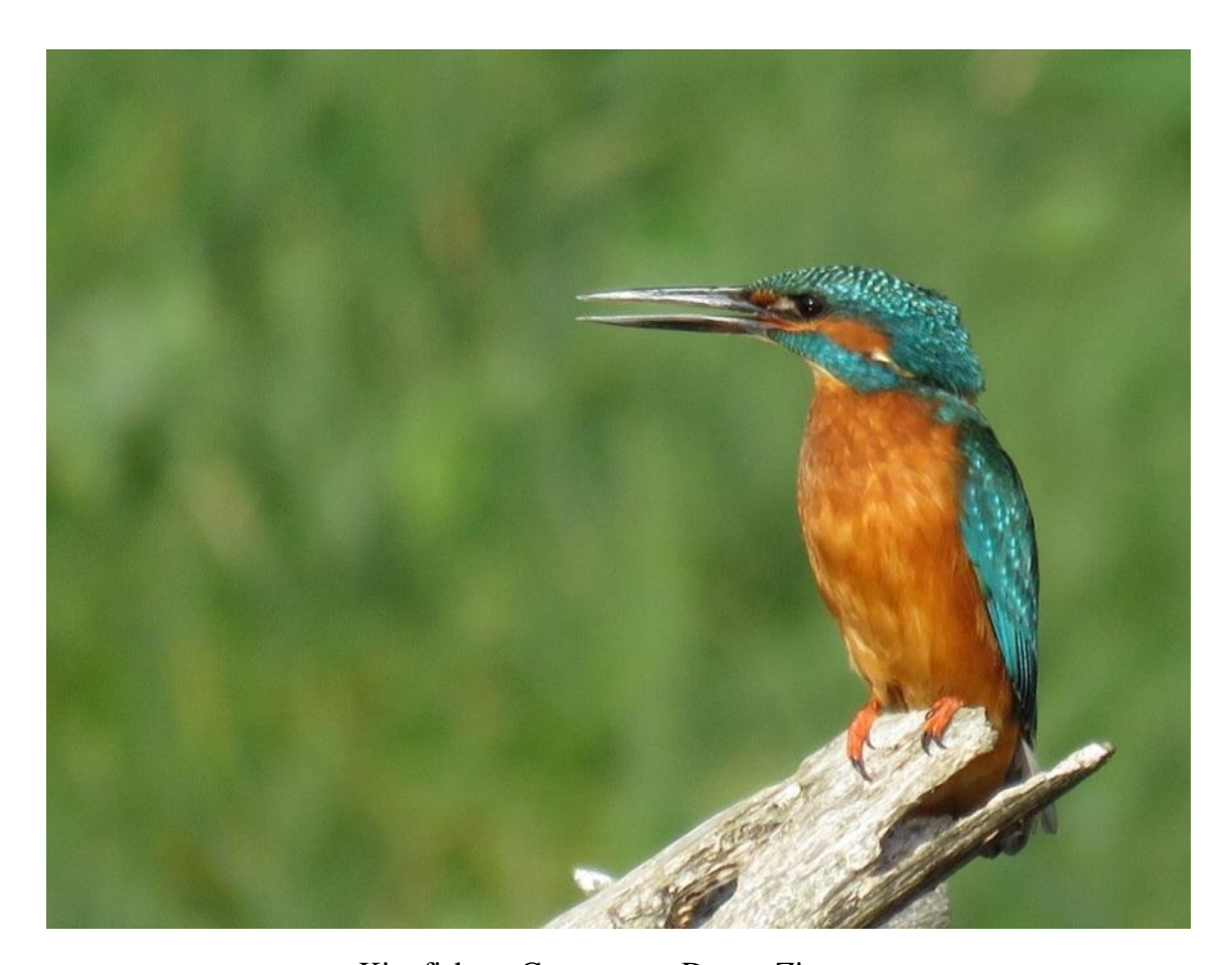
Kingfisher – Crossness – Donna Zimmer