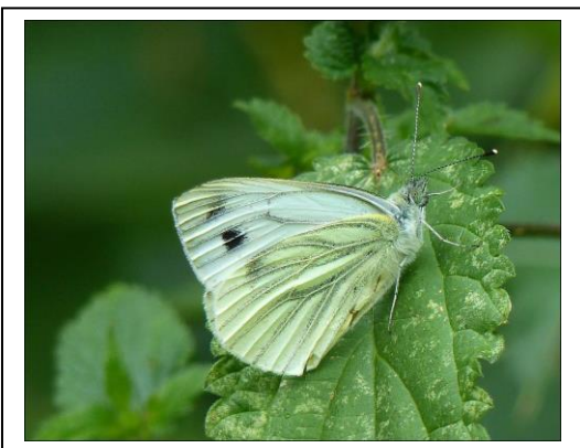
Green-veined White. Barnehurst Golf Course, July 2015.