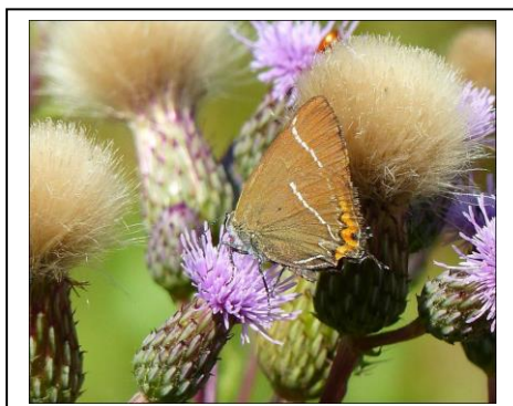
White-letter Hairstreak at Foots Cray Meadows. July 2015.

http://www.hertsmiddx-butterflies.org.uk/w-album/w-album_tips.php