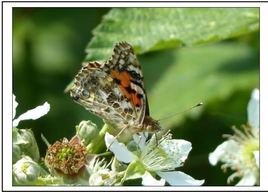
Painted Lady. Crossness, July 2015.

Peacock Butterfly ( Inachis io ) – A familiar and widespread species whose caterpillars feed on Nettles. Now the Borough's most common 'coloured' (not brown or white) butterfly early in the year, when adults emerge from hibernation. Crossness and Braeburn Park are good places to see numbers of these insects early in the year, as opposed to occasional specimens in gardens at that time.