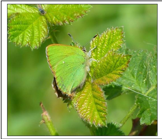
Green Hairstreak on Erith Southern Marsh. 13 th May 2016.

It is too early to tell whether there is a real expansion in the range of this species in the Borough or whether there is simply a greater, and better-informed observer effort.