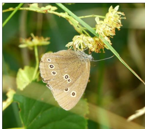
Ringlet. Barnehurst Golf Course, July 2015.