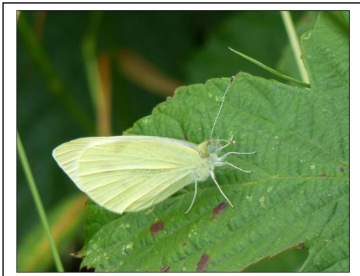
Small White. Barnehurst Golf Course, July 2015.