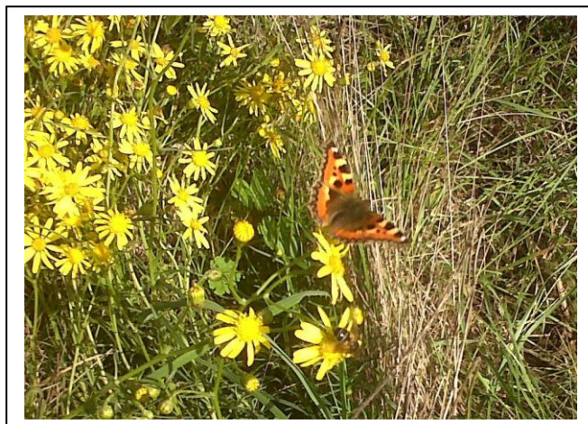
Small Tortoiseshell. Thames Road Wetland.

Small Tortoiseshell ( Aglais urticae ) - Back in the 1970s and 1980s by far the commonest 'coloured' garden butterfly in the Borough, it has declined significantly since, with part of the explanation probably being the effects of a parasite that does best in warmer parts of the country. There may be a modest recovery underway (supported from London-wide monitoring), as I saw the odd specimen at a number of sites across the Borough in spring 2014. The most reliable area to see them over the last couple of years has been Crossness and along the lower Cray and out onto Crayford Marshes.