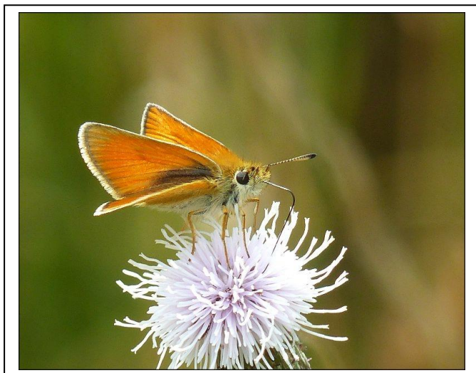
Essex Skipper, Barnehurst Golf Course, July 2015 (Mike Robinson)

Essex Skipper ( Thymelicus lineola ) - Reasonably frequent in Bexley at open, sunny sites with a semi-natural mix of grass species, such as the margins of Barnehurst Golf Course and at East Wickham Open Space. Most easily told from the similar Small Skipper by the black (as opposed to orangey) tip to the undersides of the antennae. Monitoring data from elsewhere in London since 1978 suggests a long-term decline in numbers.