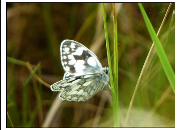
This Marbled White, pictured at Hollyhill on 24 th June 2015, turned out to be the third one recorded in Bexley.

In respect of south-east London, a report on the butterflies of Blackheath/Greenwich Park states that it was seen there in 2012 and then 2014, whereas a previous study published in 2009 did not mention the species, and that it was also seen at Greenwich Ecology Park in 2014. The author took the view that it could become established in the area. In 2014 it was also recorded in Jubilee Country Park, Bromley. If either of the individuals seen in Bexley in 2015 was a pregnant female, perhaps it can start to get a permanent foothold here. It is certainly worth looking out for again at the two sites where it was seen in 2014, and elsewhere, in 2016. The distinctive black and white check wing pattern means it is unlikely to be mistaken for anything else.