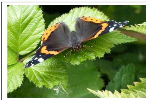
Red Admiral. Crossness, July 2015. (Ursula Keene)

Red Admiral ( Vanessa atalanta ) – A distinctive black, red and white butterfly. Primarily a migrant from North Africa and continental Europe, it now appears to be over-wintering in southern England. Often the earliest and latest butterfly species to be seen in the year. A strong flier, it will turn up anywhere, including in gardens.