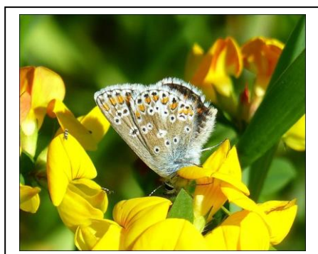
Brown Argus, Crossness. June 2015. Picture to left shows diagnostic 'colon' spot pattern in middle of the leading edge of the hindwing.