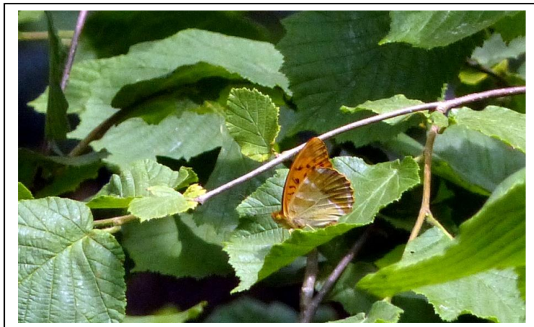
Silver-washed Fritillary in Joydens Wood, 2015. (Ralph Todd)

Silver-washed Fritillary ( Argynnis paphia ) – A butterfly of broad-leaved woodland. The caterpillar foodplant is the Common Dog Violet. The species is considered to be extending its range again after a decline during the twentieth century, but has only been recorded from a handful of sites in London. During 2015 there were sightings from Joydens Wood, but with the Borough boundary passing through woodland, observers were not one hundred percent certain they had seen it on the London side of the line. Its presence in Bexley was, however, later confirmed by Joe Johnson, who saw one on Cocksure Lane in August 2015.