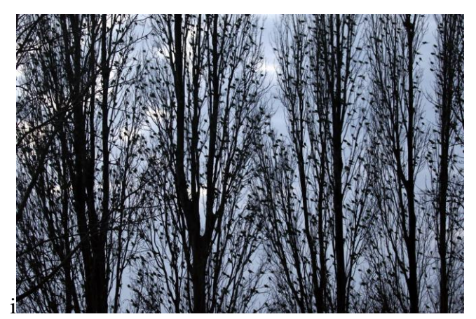
Ring-necked parakeet roost Danson Park

All seven records of yellow wagtail were between 25<sup>th</sup> August (two over FCM)-12<sup>th</sup> September (one off Thamesmead golf course), all other records from CM. Grey wagtails we re present along the rivers Shuttle/Cray and on the marshes. The pied wagtail roost in Market Square seems to have moved so 22 FCM 5<sup>th</sup> October and c50 CX 27<sup>th</sup> December are the best counts available.