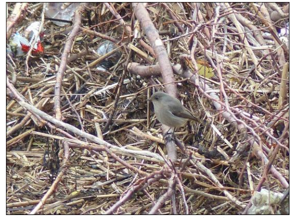
Black redstart Thames foreshore Corinthian Manorway

Nuthatch regularly seen DP, FCM, HP and GL with occasional sightings BPW. Treecreeper however remained very elusive with just two records from FCM – one on 24<sup>th</sup> and 3 25<sup>th</sup> August.