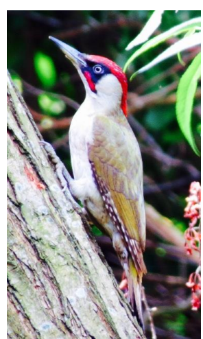
Green Woodpecker Hall Place