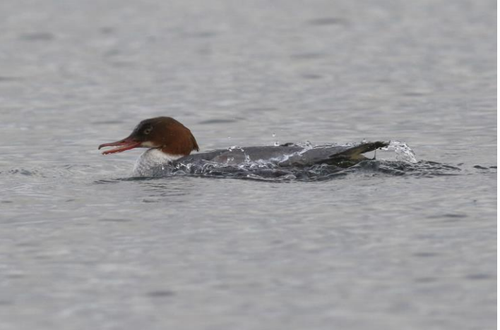
Goosander Danson Park