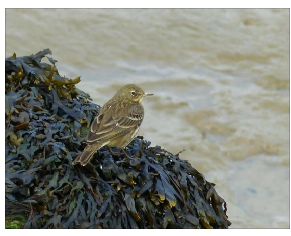
Rock pipit – Thames foreshore Corinthian Manorway