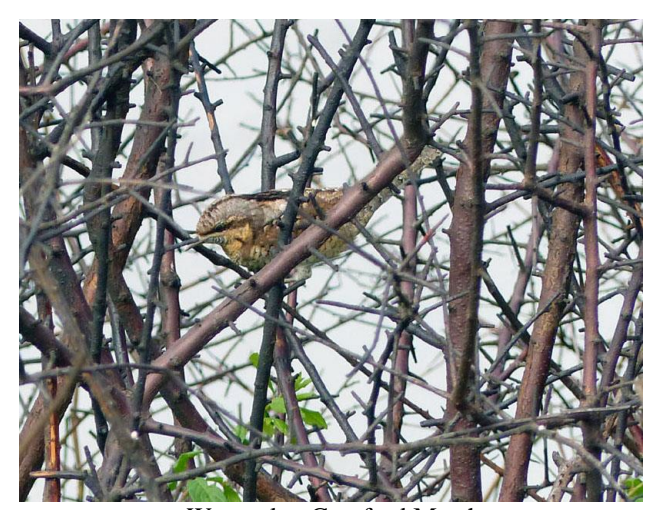
Wryneck – Crayford Marsh

Sandwich terns were an uncommon visitor/migrant so four records from CX (2 birds on 8<sup>th</sup> and 9<sup>th</sup> August) and one of a single bird at CM on 10<sup>th</sup> September represented the autumn passage. The last common tern seen at CX 30<sup>th</sup> August and four at CM 16<sup>th</sup> September the last there, otherwise between 9<sup>th</sup> and 11<sup>th</sup> August was the best time for numbers passing by CX with 50 on the 9<sup>th</sup> the peak. Only four records for Arctic tern , six at CM on August 6<sup>th</sup> the peak and one CX on 14<sup>th</sup> was the last seen.