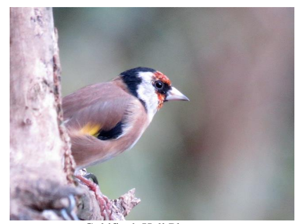
Goldfinch Hall Place